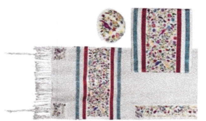
Garden of Eden