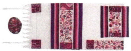
New Four Mothers